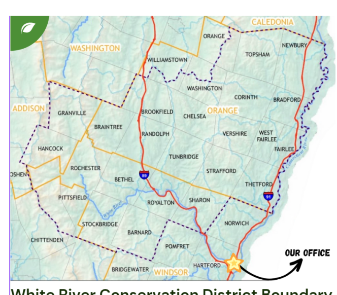
White River Conservation District Boundary